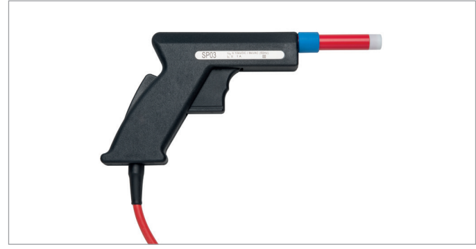
High voltage test pistol SP 03 With start switch